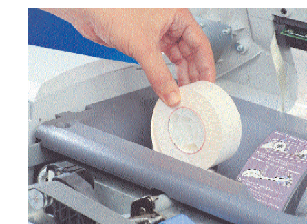
Drop-In Roll Tape – It's quick and easy to replace and dispenses cut-to-size tapes – either gummed or pressure sensitive.

• Dual Tape Capability – Hassle free Drop-In Roll Tape, a standard feature, accommodates either gummed or pressure sensitive tape. This enables you to apply tape to virtually any material.