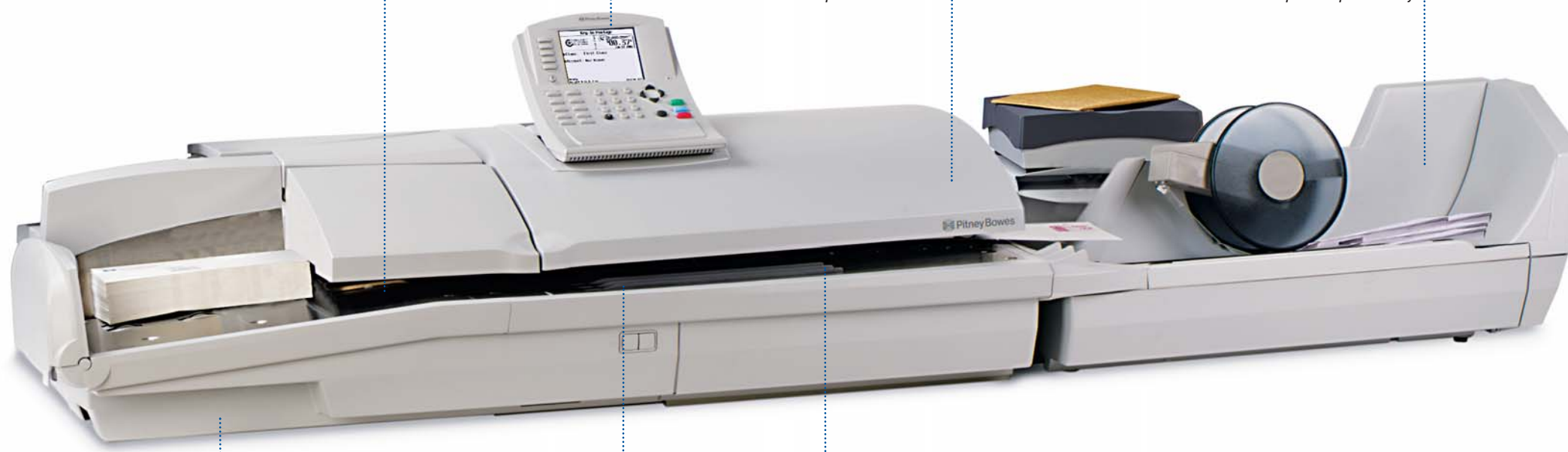
Mixed Mail Feeding enables automatic feeding of various sized pieces