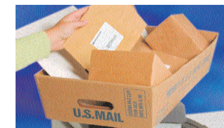
Step 1 – Place your mail pieces and parcels on the platform. As you remove a piece, the system calculates the appropriate postage (based on the weight removed from the stack) and displays it on the Control Center.

• Differential Weighing – This feature gives you maximum flexibility by allowing you to process mixed weight mail pieces and parcels together in the same run. There are just two simple steps: