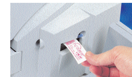
Step 2 – Feed envelopes through the DM900 or press the tape button for parcels. The correct postage is then imprinted, and the piece is ready to go.