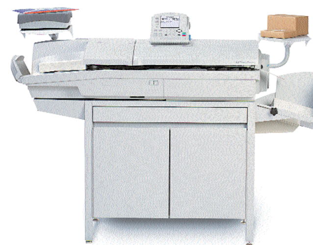
System pictured above includes the optional Console and Drop Stacker. Both of these features help to maximize productivity.

If you need service, our nationwide network of 2000 trained Pitney Bowes service professionals is ready to help. Our Computer Enhanced Service Management System lets us record your request, instantly call up a complete history of the equipment, and quickly dispatch a local Customer Service Representative with the right skills.