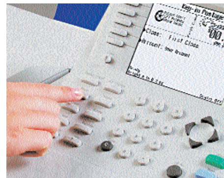
IntelliLink Control Center offers ease of use and access to services

• IntelliLink™ Control Center – All of the system's functions, including updates, are activated and controlled from a single point. This makes the operation easy – even for the casual operator.