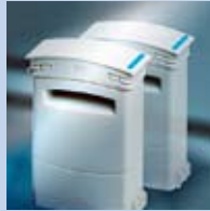
HP Bulk Ink Delivery