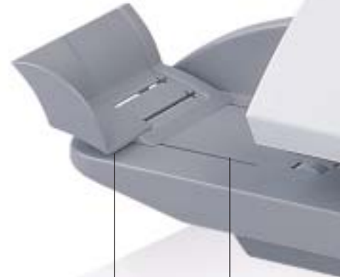
Hassle-free AutoFeed allows you to process up to 95 letters per minute

The IJ-50's advanced inkjet technology produces a crisp, clear indicia and a clean, positive message about your business. Choose from a selection of customized promotional slogans, and create or adapt your own text messages in just seconds.