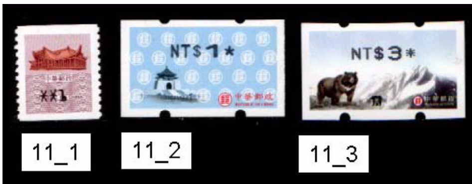
(11_1) Unisys: Sun Yat-sen Memorial Hall (1995); (11_2) Nagler: Chiang Kai-shek Memorial Hall (2001); (11_3) varioSyST: Formosan Black Bear (2004).

Unisys: 1995-2000 (2 issues) Nagler: 2001- (10 issues) varioSyST: 2003- (10 issues)