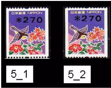
(5_1) Omron: flying sparrow (1997); (5_2) Fuji Electric: flying sparrow (1998).