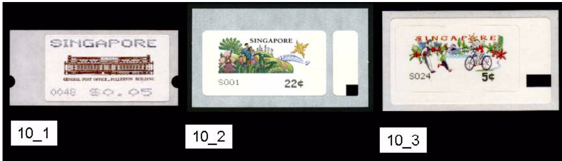
(10_1) Almex: GPO (1990); (10_2) Metric: “Sunny Singapore” (1997); (10_3) Metric: “Healthy Singapore” (2000).