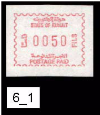
(6_1) Frama mark 1: white paper (1984).

Frama mark 1: 1984-1997 (interruptions) (1 issue)