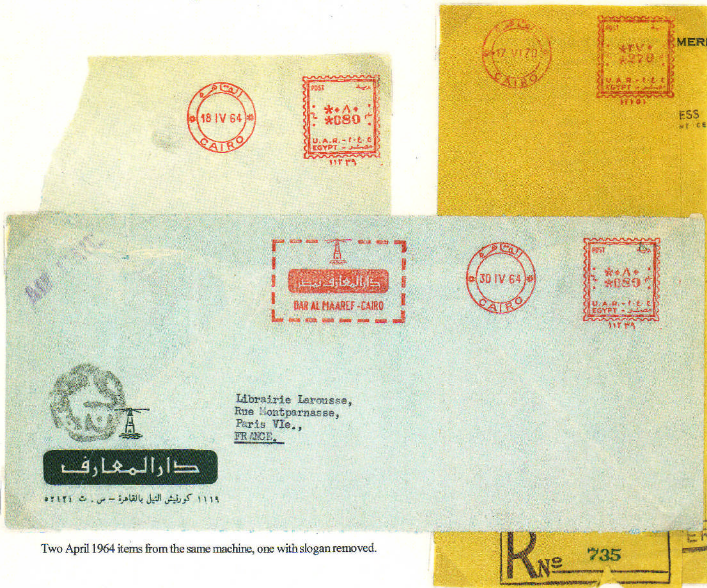
Two April 1964 items from the same machine, one with slogan removed.

In the actual exhibit, this page is 11” x 11”.